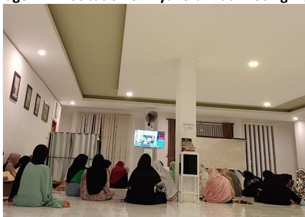
Image: A.2 Recitation of Ihya' Ulumiddin Using Digital TV